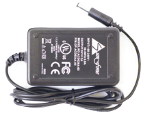
Power supply for AmiNET130

The AmiNET130 is supplied with the following accessories: