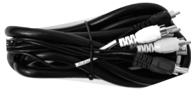
Component Video lead*

* Your service provider may supply different leads from that shown.